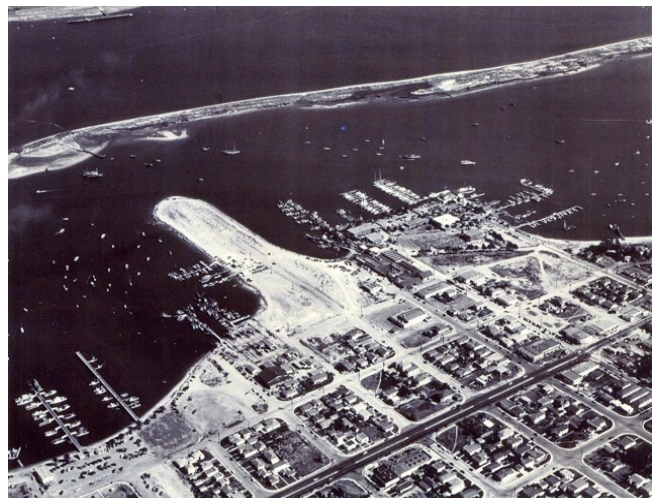
Byron Street mole awaits connection to the rising Shelter Island.