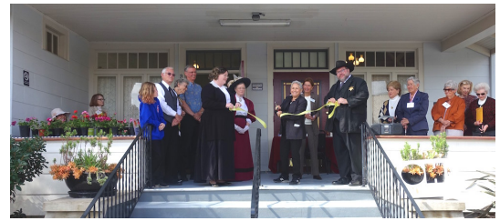
A ribbon-cutting ceremony started the day at 10 a.m.