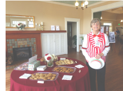
Flowers donated by Point Loma Village Florists added to the décor.